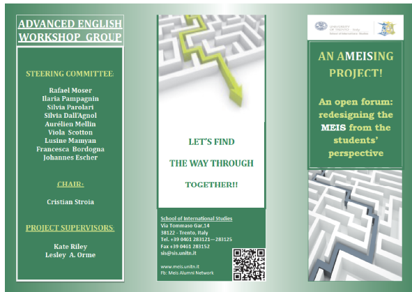
Fig. 2. Front of student-designed flier for the project presentation and open forum.

The presentation embodied in full the ‘Sharing Practices’ spirit of the SPEAQ project, inviting fellow students, faculty members and administrative staff to participate in this open forum. It is worth noting, that the students were very careful to embrace the principles of their own project by striving to communicate effectively with their target audience(s).