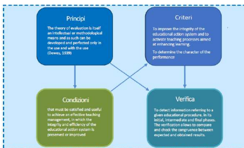
Fig. 2 - Criteria and conditions

The criteria in the evaluation are related to the construction of the relationship between discourse and practices as in Figure 1 below.