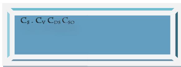
Figure1. Communication circuit in the DS